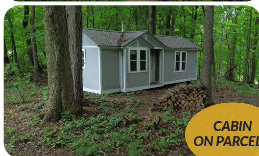
CABIN ON PARCEL 1